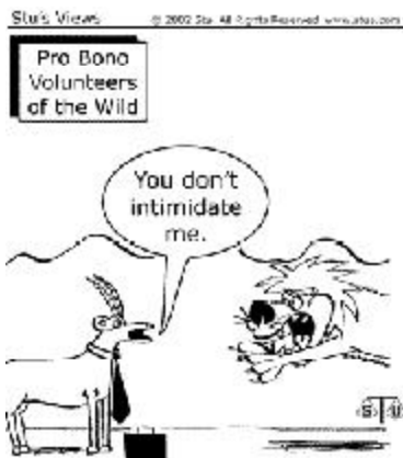
Cartoon courtesy of Stu Rees

Race for Justice, Potter Park Zoo Lansing, Michigan